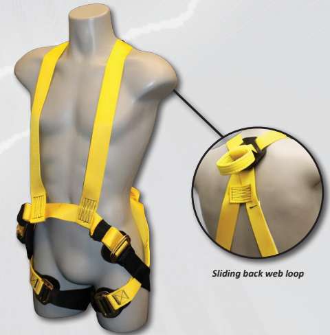
Sliding back web loop

6' Dual-leg elastic shock absorbing lanyard #135A (2 1/2" gate opening) aluminum snaphooks Harness choke loop