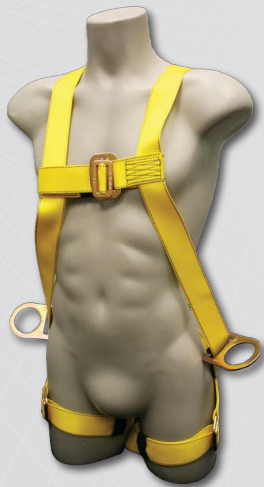
♦♦ 631B 3 point adjustment Hip positioning D-Rings Pass-thru leg buckles