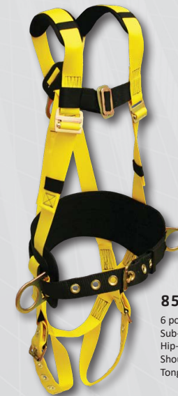
853AB 6 point adjustment Sub-pelvic strap Hip-positioning D-Rings Shoulder pads Tongue buckle/grommet legs