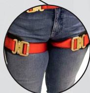
Female fit leg straps

6 point adjustment Female fit legs straps Hip positioning D-Rings Bayonet chest buckle Bayonet leg buckles