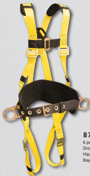
870AB 6 point adjustment Shoulder pads Hip positioning D-Rings Bayonet leg buckles