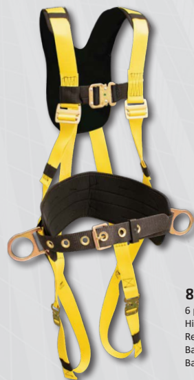
870BP 6 point adjustment Hip positioning D-Rings Removable Back Pad Bayonet chest Bayonet leg buckles