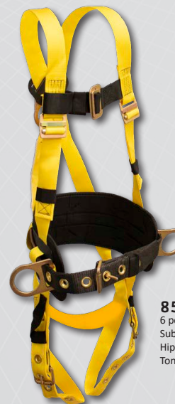
853B 6 point adjustment Sub-pelvic strap Hip-positioning D-Rings Tongue buckle/grommet legs