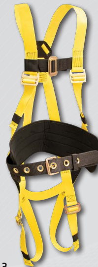
833 6 point adjustment Sub-pelvic strap Pass-thru leg buckles