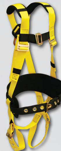
853A 6 point adjustment Sub-pelvic strap Shoulder pads Tongue buckle/grommet legs