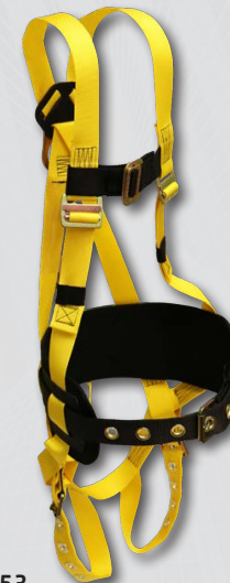
853 6 point adjustment Sub-pelvic strap Tongue buckle/grommet legs