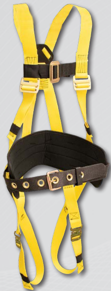
870 6 point adjustment Bayonet leg buckles